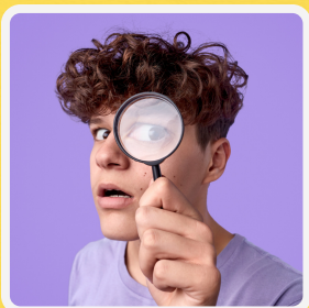
Figure out what you REALLY want to accomplish from this experience. Don't think about short term, think beyond this experience, like 5-10 years later. This will help you to use your reign to make connections that will benefit you for years to come.